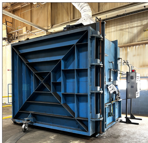
NIAGARA METAL FINISHERS TEMPER FURNACE