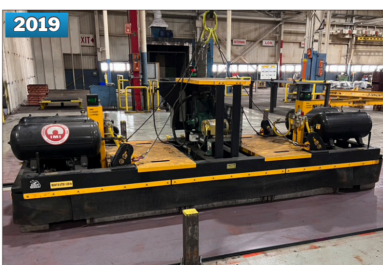
2019 INDUSTRIAL MAGNETICS (IMI) MAGNETIC PLATE LIFTER