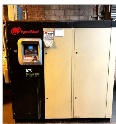
INGERSOLL RAND AIR COMPRESSOR