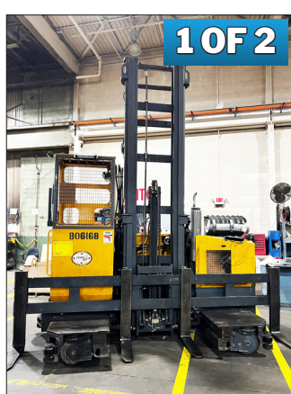
1 OF 2 NARROW ISLE COMBI-LIFTS