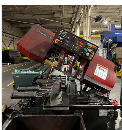
AMADA BAND SAW