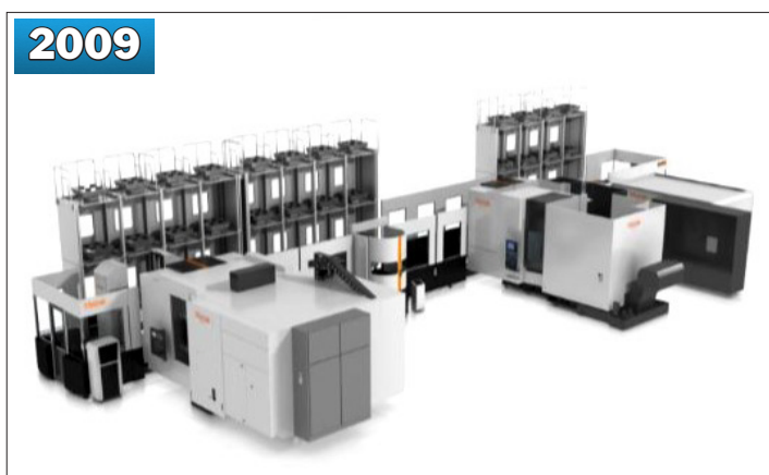
2009 MAZAK HORIZONTAL MACHINING CELL CONSISTING OF (2) MAZAK HCN-6800-II CNC HORIZONTAL MACHINING CENTERS