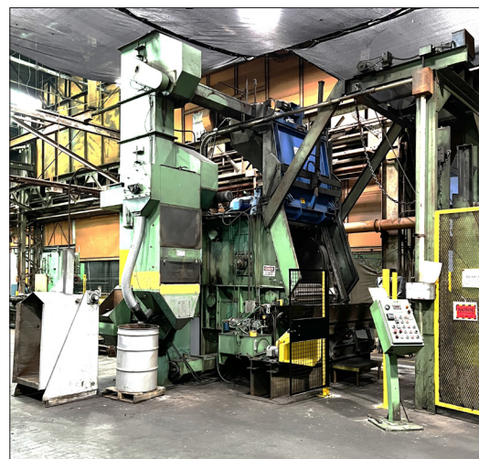
WHEELABRATOR 22-SUPER BATCH TYPE TUMBLAST