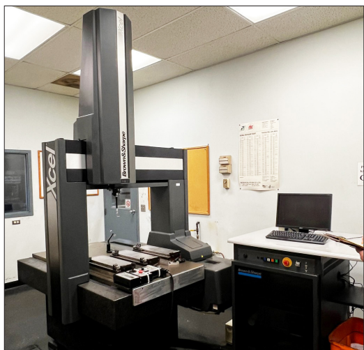
BROWN & SHARPE 7.10.7 COORDINATE MEASURING MACHINE