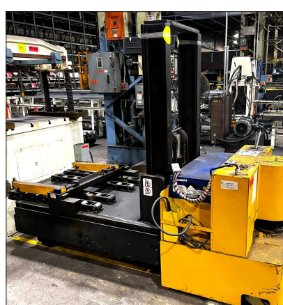
SROKA ELECTRIC DIE HANDLER