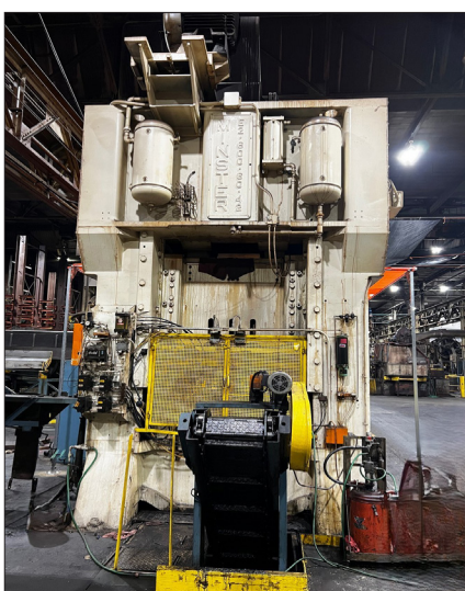
MINSTER E2.600.60.40 PRESS